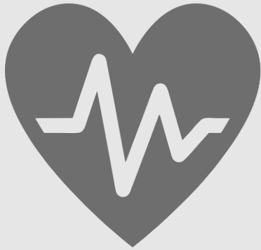
Treatment & Coordination of Care