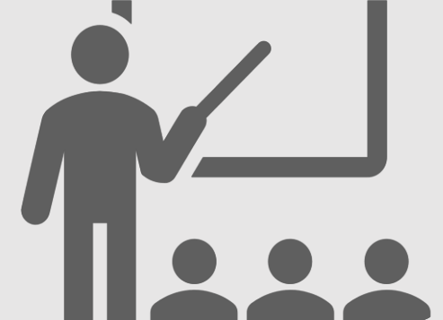
Workforce Development & Training