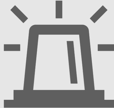
Prevention & Public Safety