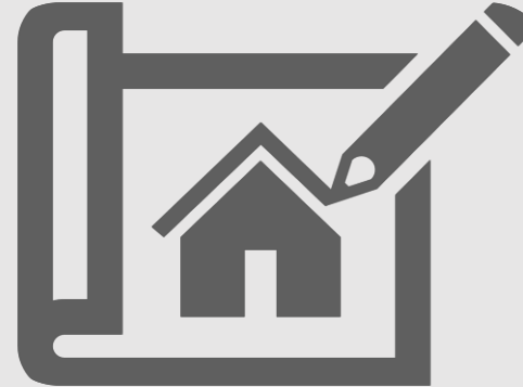
Recovery Support Services